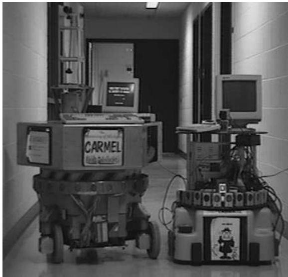
Figure 2: CARMEL (left) and BORIS (right), robots used in several multibot projects.

BORIS’s camera is fixed to BORIS’s top facing directly ahead of BORIS.) Low level functionality, was similar, but the robots had different implementations of some basic functions, such as obstacle avoidance.